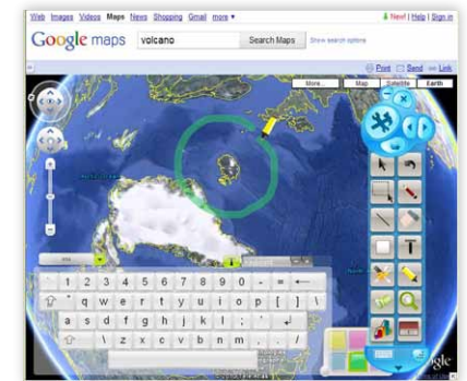
WizTeach InFocus Edition software