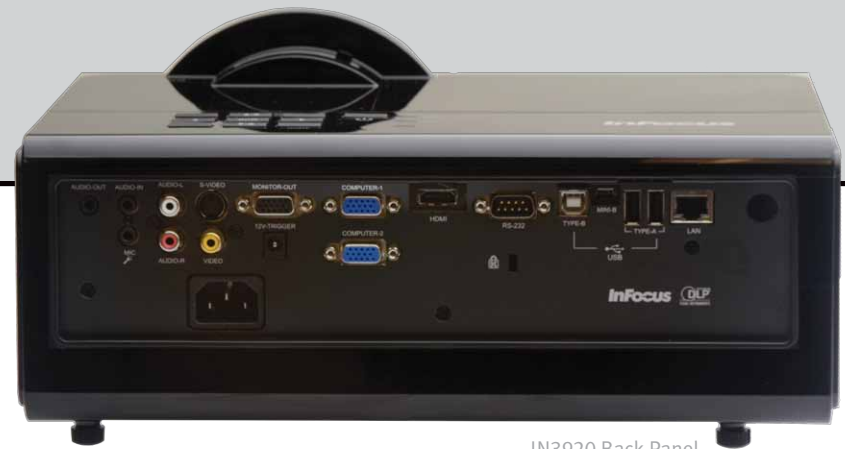
IN3920 Back Panel