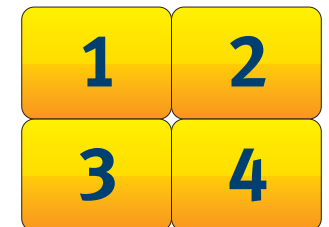
Project up to 4 computer screens at the same time

“... As transformative for education as early interactive boards were – maybe more.”