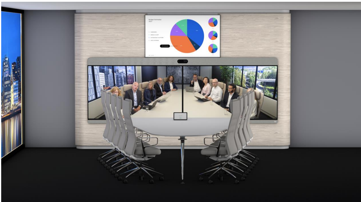
Figure 2. Cisco Webex Room Panorama in a large conference room