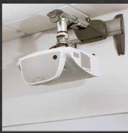
Designed for interactive and ultra short throw projectors