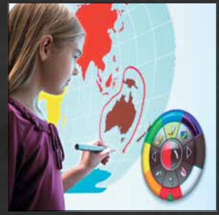
Marker board capabilities

The latest Dry Erase Screen features upgraded durability, surface uniformity and rigidity to ensure a superior interactive experience. The erasable surface is hotspot-free under projection, and now comes with new standard features - all Dry Erase Screens are magnetic and have a thin frame. It can be used with an ultra short throw projector as an interactive screen or as a whiteboard with dry erase markers.