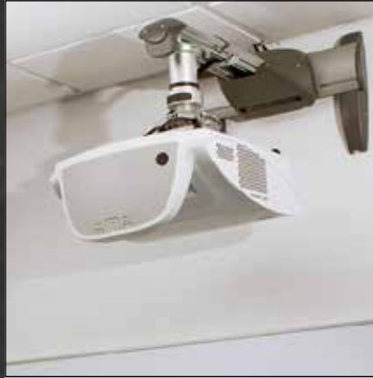
Designed for interactive and ultra short throw projectors