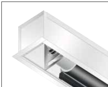
Easy Serviceability System