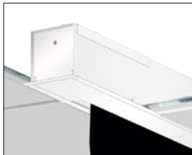
Perfect integration into the ceiling