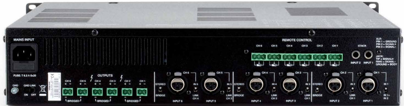
4-80R, 6-80R and 4-400R back panel connectors and switches style